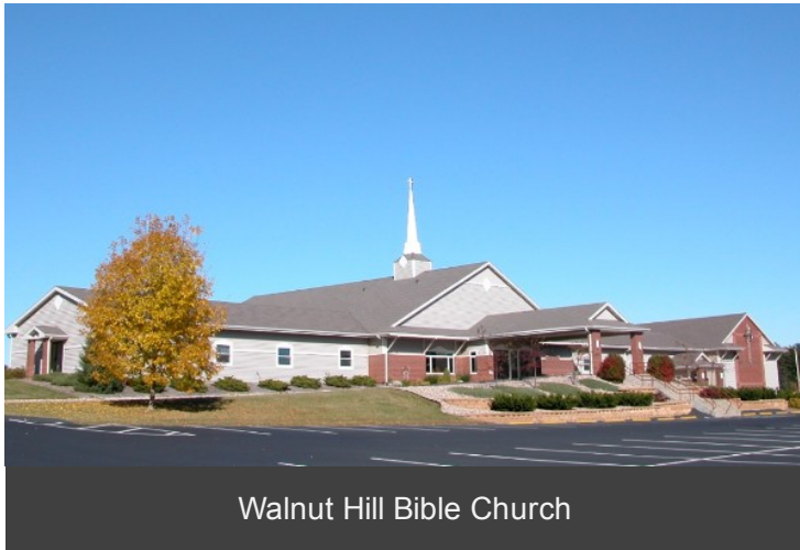
Walnut Hill Bible Church